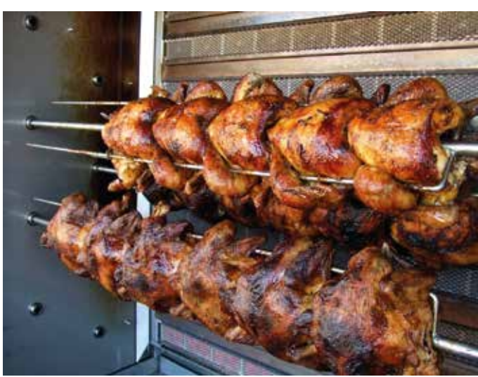
(All above Are Served With Accompaniment Of Your Choice; Rice, Fries, Wedges, Mashed Potatoes, Boiled Irish, Chapatti, Posho & Steamed Vegetables)