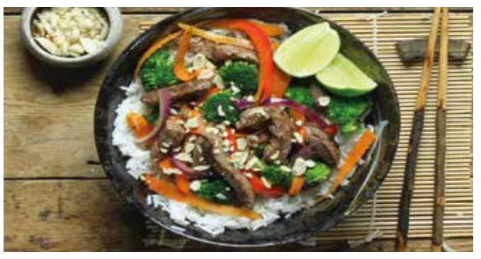
(All above Are Served With Accompaniment Of Your Choice; Rice, Fries, Wedges, Mashed Potatoes, Boiled Irish, Chapatti, Posho & Steamed Vegetables)