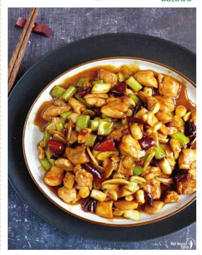
(All above Are Served With Accompaniment Of Your Choice; Rice, Fries, Wedges, Mashed Potatoes, Boiled Irish, Chapatti, Posho & Steamed Vegetables)

(Cubes of Chicken Breast & Selection of Vegetable stir Fried with Cashew Nuts & Oyster Sauce)